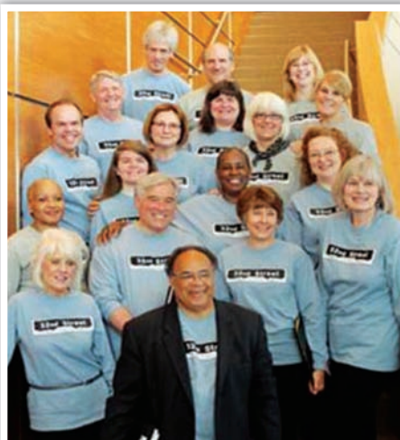
The 32nd Street Singers

We will briefly highlight what FAA&F has done over the past year and will distribute our annual report, but the main focus will be to honor some incredible alumni, inducting them into the Franklin Hall of Fame. Our last Hall of Fame dinner was in 2004 and it is time to acknowledge some of our amazing graduates once again. We plan to make this an annual event. If you have nominations to suggest for the future, please let us know.