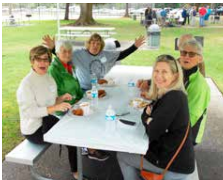
Classmates enjoy the picnic