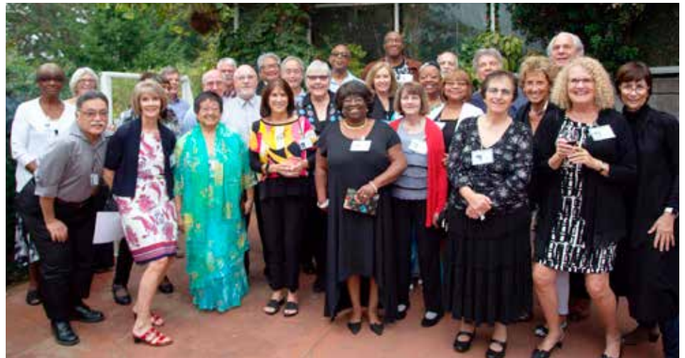
above: 68 Mercer classmates below: 68 Sharples classmates