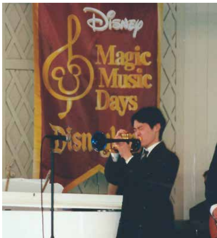
Playing with Franklin Jazz Lab at Disneyland 2001