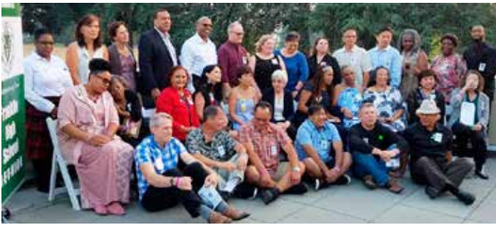
Group Pic Class of 78