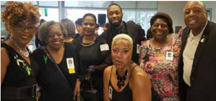
Class of 78 Happy to reunite

Our reunion was a hit. We joined together Aug 24 at the Jefferson Park Golf Clubhouse. More than 100 attended! Thanks to ALL of our classmates, spouses, and significant others who made the night memorable. Lots of smiles all night throughout the room! Please share your pictures here so we can all share together! Here's your EARLY notice. We are joining with CLEVELAND HS, for the next gig, our 45th Class (es), reunion, in 2023. It'll come up fast. Mark your calendars!