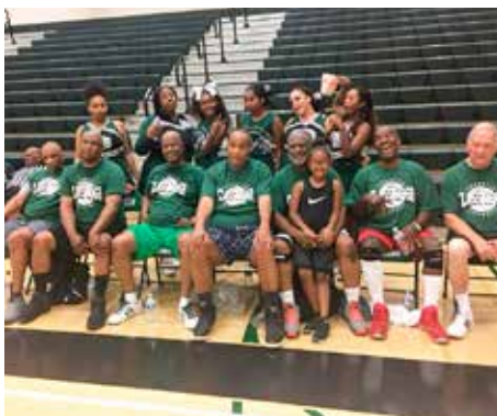
68 Franklin's winning basketball team